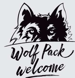
Wolf Pack Welcome imagery.