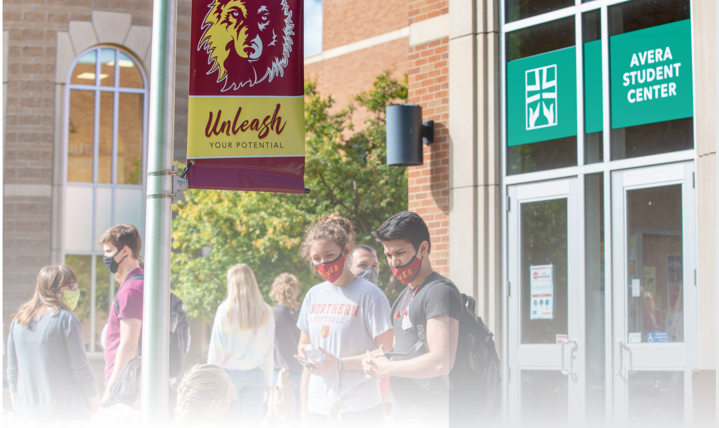
Students enjoying the Fall 2020 Involvement Fair.

then given the challenge to create a safe on-campus experience only a month after offering a whole new virtual experience. Few, if any other institutions across the country were doing in-person orientation, so this required a great deal of attention to detail and innovation from the New Student Programs team.