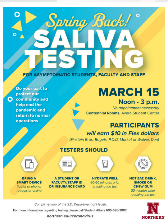
Spring Break Mass Test Event poster.