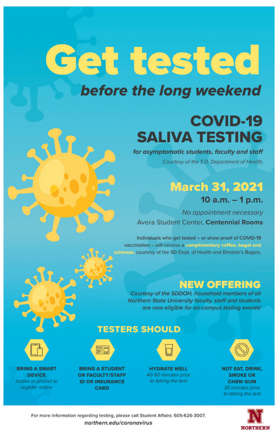
March 2021 Mass Test Event poster.